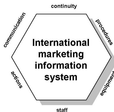
Figure 1 The international marketing information system

Viewed like this, the international marketing information system has taken over the role of corporate information systems, and also represents a continuous work in the process of in-house and external communication. The functioning of the international marketing information system provides a company with continuous information required for high-quality marketing decision-making. The international marketing information system can be graphically represented as follows: